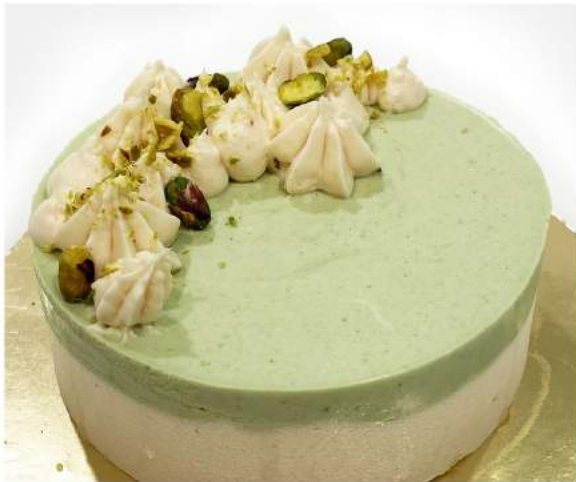
CE14 WHITE PEACH PISTACHIO Vanilla Pistachio Sponge Cake, White Peach Puree, Pistachio