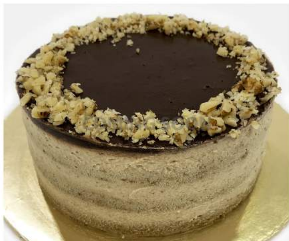
CE57 GREENTEA CHESTNUT MOUSSE