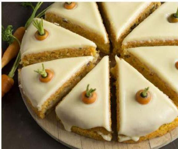
CE23 MEDIEVAL CARROT ZUCCHINI Fresh Carrot, Fresh Zucchini, Walnut, Cream Cheese Frosting