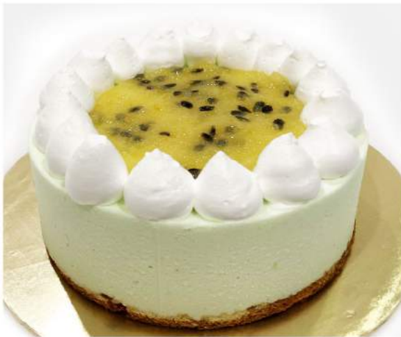
CE21 LIME PASSION FRUIT Fresh Lime Coulis, Fresh Passion Fruit, Whipped Cream, Vanilla Sponge