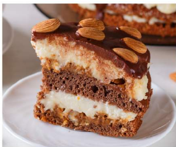
CE44 CHOCOLATE ALMOND MOUSSE Chocolate Sponge Cake, Chantilly Cream, Almond Nibs with Caramel, Dark Chocolate Ganache