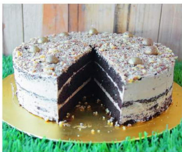
CE09 MILO DINO Milo Whipped Cream, Milo & Chocolate Sponge Cake, Milky Pearls Topping