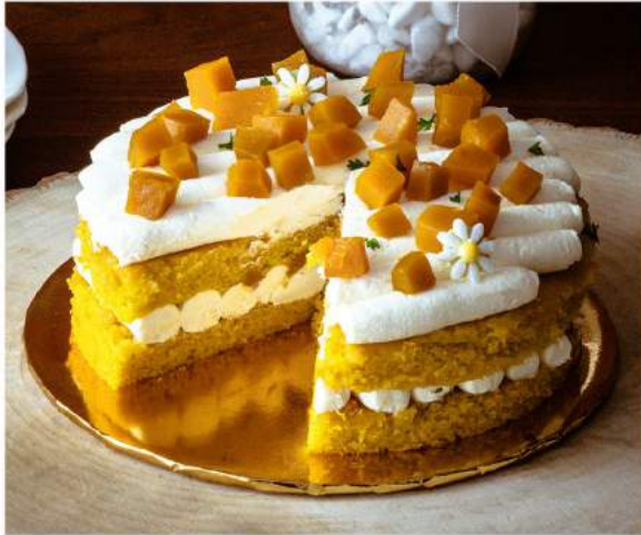
CE13 SPICED PUMPKIN Spiced Pumpkin Sponge Cake, Vanilla Cream Cheese Frosting, Pumpkin Chunks