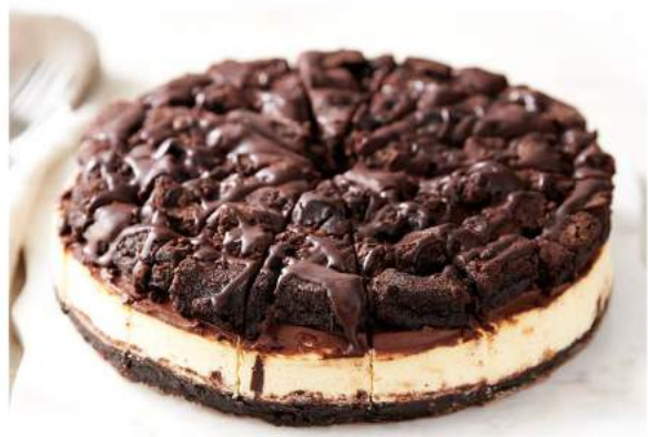
CE33 BROWNIE CHEESE Creamy Cheese Cake, Brownie Cake Base, Dark Chocolate Brownie Topping, Dark Chocolate Ganache Drizzle