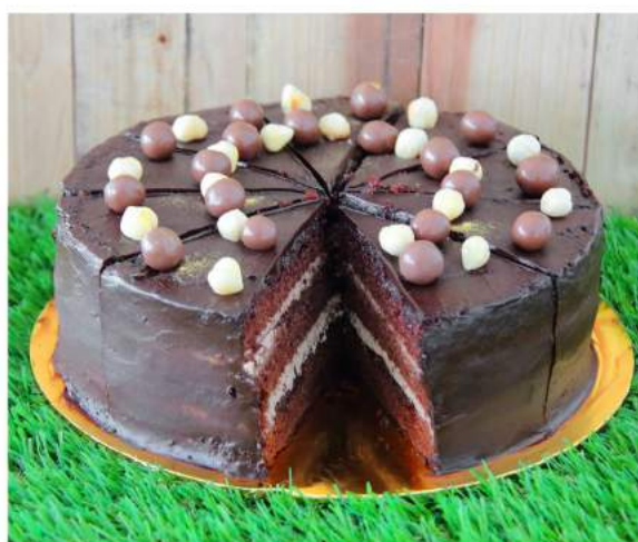
CE10 EXCLUSIVELY CHOCOLATE Chocolate Sponge Cake, Hazelnut Cream, Dark Chocolate Frosting, Chocolate Pearls