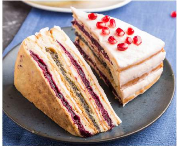
CE17 RASPBERRY PISTACHIO Pistachio Puree, Raspberry Puree, Caramel Sauce, Whipped Cream