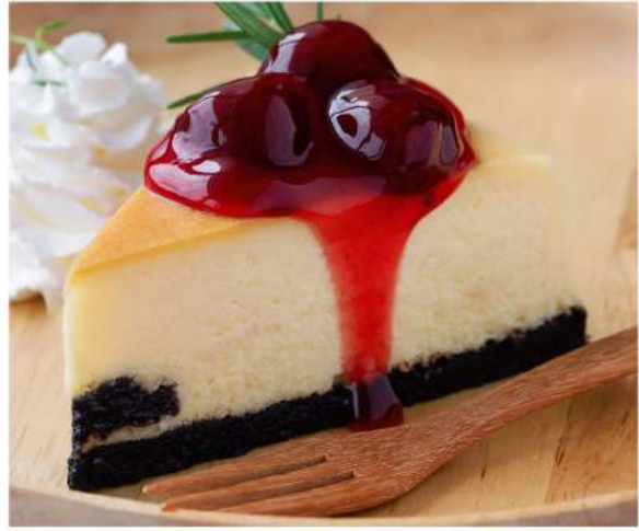
CE35 OREO CLASSIC CHEESE Baked Cheese with oreo Crumbs, Oreo Crumb Base