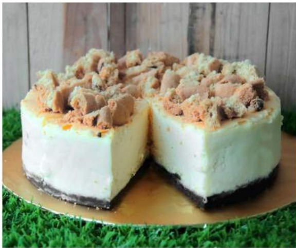
CE30 CHEESY CHOC CHIP OREO Rich Baked Cheese Cake, oreo Crumb Base, Chocolate Chip Cookies, Crumb Topping