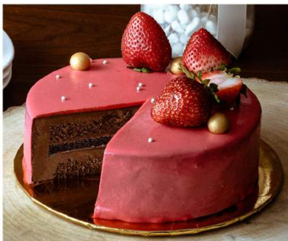
CE38 LION HEART MOUSSE Dark Chocolate Sponge Cake, Dark Chocolate Mousse, Strawberry Coulis Layer, Fresh Strawberry Topping