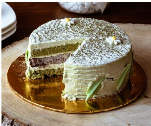
CE05 AZUKI MATCHA Matcha Sponge Cake, Azuki Red Bean Cream, Matcha Whipped Cream