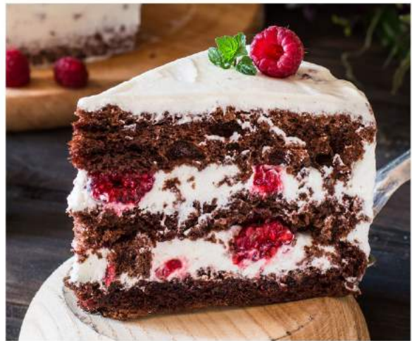
CE16 RASPBERRY CHOCOLATE Chocolate Sponge Cake, Whipped Cream, Raspberry Fruit