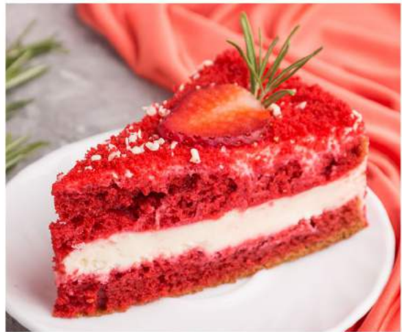
CE22 VELVET STRAWBERRY Fresh Strawberry, Red Velvet Sponge, Cream Cheese