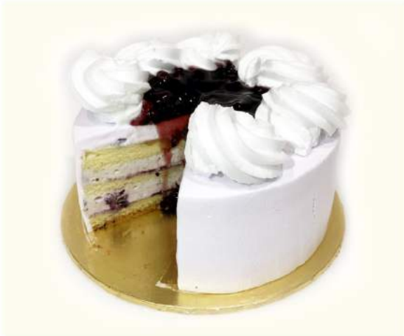
CE53 BLUEBERRY CHEESECAKE Creamy Baked Cheese with Fresh Blueberries, Blueberry Compote Topping, Cookie Crumb Base