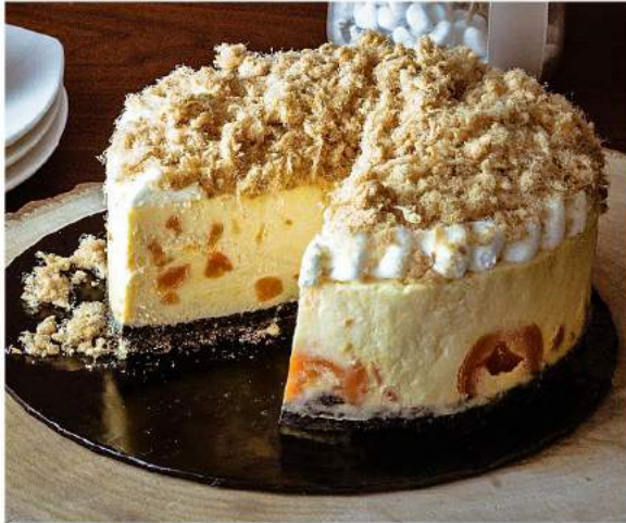
CE28 SALTED EGG CHICKEN FLOSS CHEESE Rich Baked Cheese with Salted Egg Yolks, Custard Cream, Sweet & Savoury Chicken Floss