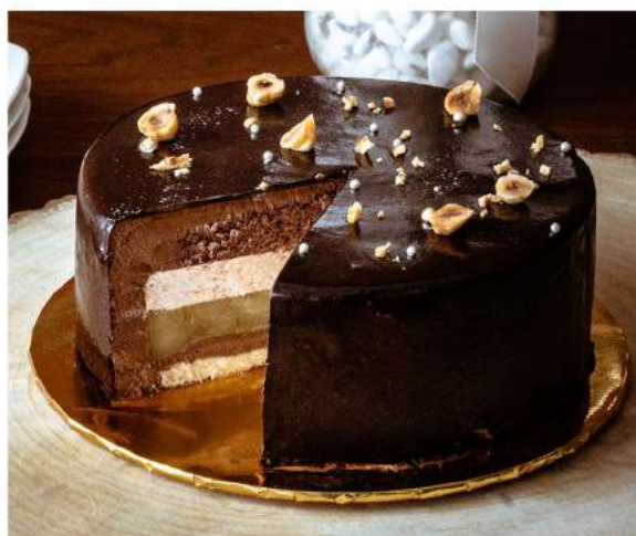
CE41 AUX TROIS CHOCOLATE MOUSSE Chocolate Sponge Cake, Hazelnut Chantilly Cream, Pineapple Coulis, Vanilla Sponge, Dark Chocolate & Hazelnut Mousse, Dark Chocolate Glaze