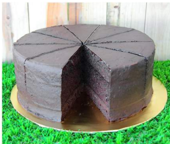
CE08 WANNA HAVE SOME FUDGE Dark Chocolate Fudge, Dark Chocolate Sponge, Dark Chocolate Frosting