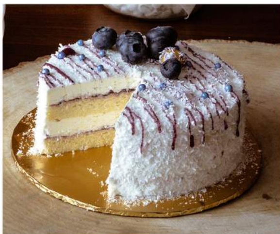
CE01 BLUEBERRY COCONUT TORTE Coconut Whipped Cream, Cream Cheese, Fresh Blueberry Compote, Vanilla Sponge Cake, Coconut Flake