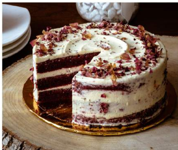
CE06 VELVET ROSE Red Velvet Sponge Cake, Rose Infused Cream Cheese Frosting, Dried Rose Petal Topping