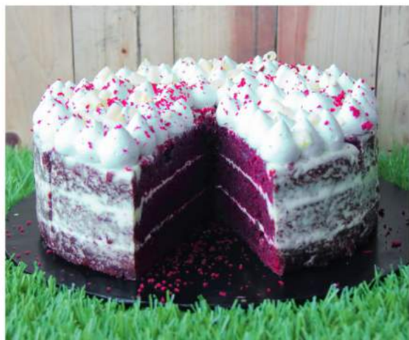
CE11 MISSUS VELVET Red Velvet Sponge Cake, Cream Cheese Frosting, White Chocolate Curls