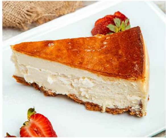
CE37 CREME BRULEE CHEESE Rich Dense Baked Cheese Cake, Brulee Caramel Topping, Cookie Crumb Base