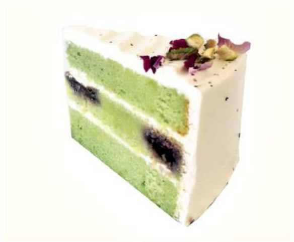
CE26 PISTACHIO CHERRY & ROSE CREAM Pistachio Butter Sponge Cake, Morella Chery, Rose Chantilly Cream, Toasted Pistachio Nuts, Rose Petals