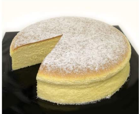
CE54 JAPANESE SOUFFLE CHEESE Japanese Style Fluffy Souffle Cheese Cake