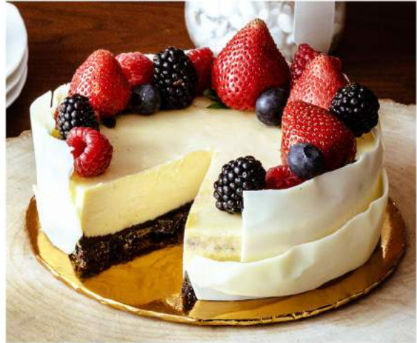
CE29 WHITE CHOCOLATE CHEESE White Chocolate Cheese Cake, Oreo Crumb Base, Fresh Berries Topping