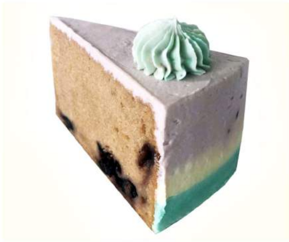
CE27 EARL GREY LAVENDER Earl Grey Tea, Infused Sponge Cake, Blueberries, Lavender Tea Infused Buttercream Frosting