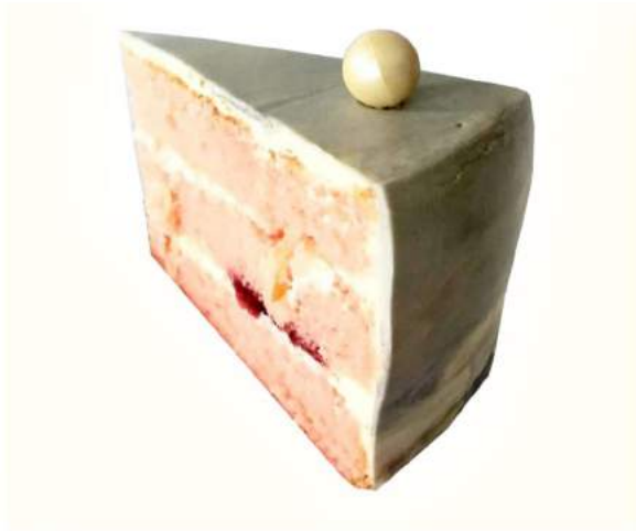
CE25 CONCRETE STRAWBERRY & LYCHEE Strawberry Sponge Cake, Strawberry, Lychee, Vanilla Chantilly Cream, Buttercream Frosting, Grey Charcoal Ash