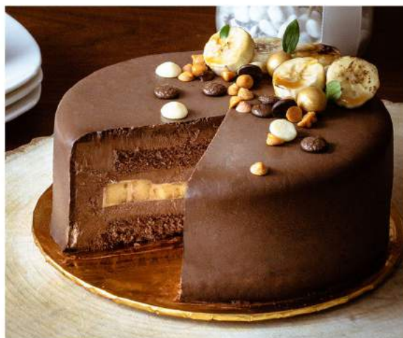
CE39 CHOCOLATE CARAMELIZED BANANA MOUSSE Dark Chocolate Sponge Cake, Dark Chocolate Mousse, Banana & Caramel Layer, Chocolate Ganache