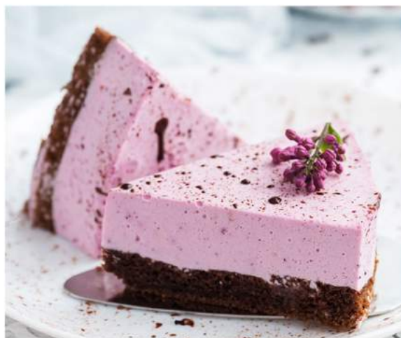
CE43 LAVENDER MOUSSE Lavender & Lemon Infused Mousse, Chocolate Fudge Base