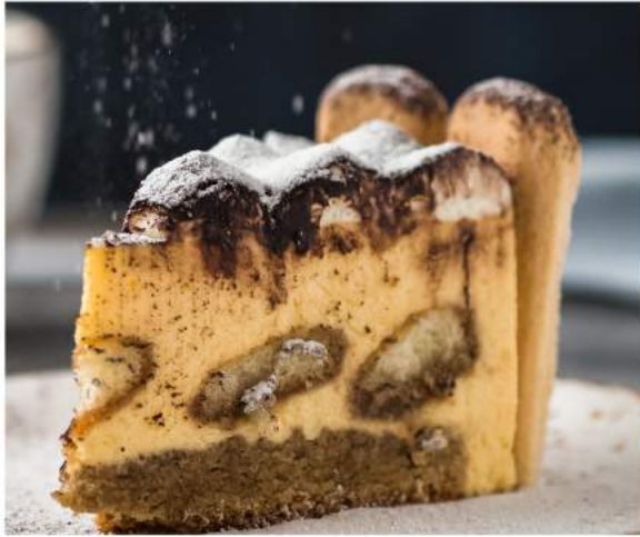
CE19 TEH-RAMISU Mascarpone Cheese, Whipped Cream, Tea Soaked, Lady Finger Sponge