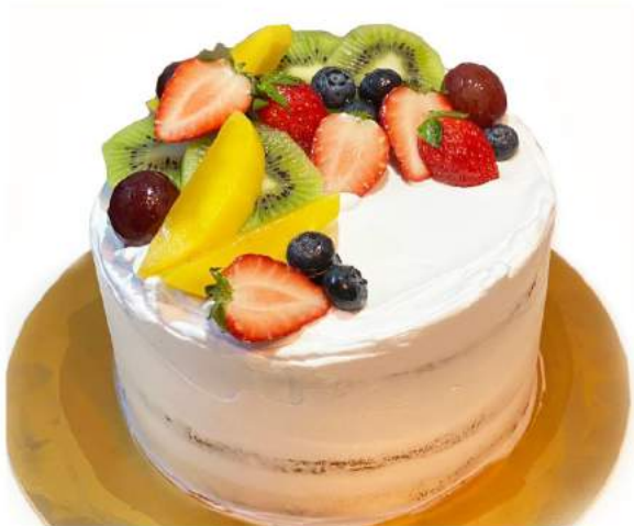
CE51 FRUIT FLAN Assorted Fresh Fruits, Vanilla Sponge Cake, Whipped Cream, Toasted Almond Flakes