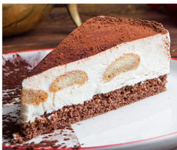
CE45 TIRAMISU MOUSSE Espresso Soaked Lady Finger Sponge, Mascarpone Cheese Whipped Cream, Cocoa Powder Topping