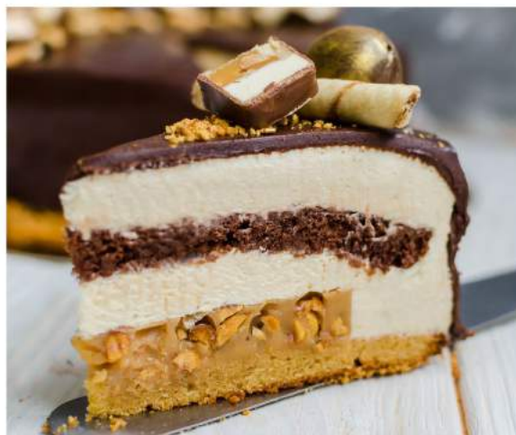
CE46 CHOCOLATE PEANUT MOUSSE Dark Chocolate Sponge Cake, Chunky Peanut Butter Layer, Peanut Mousse, Dark Chocolate Ganache