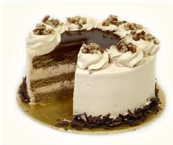
CE56 CAPPUCINO PECAN MOUSSE Coffee Sponge Cake, Coffee Mousse & Pecan Nuts, Chocolate Coffee Ganache Topping