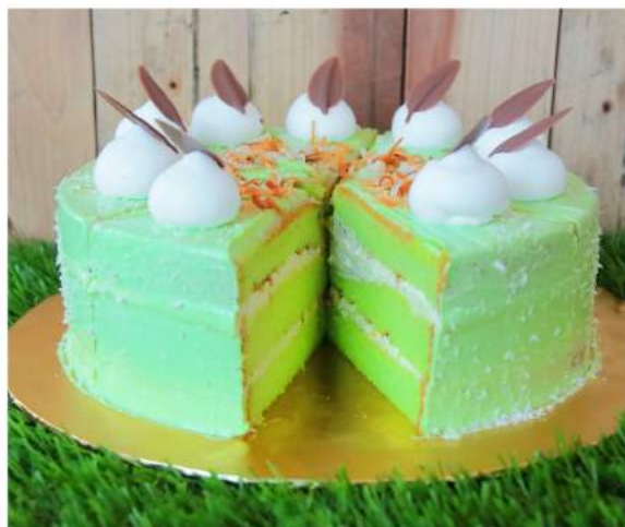
CE12 PANDAN ONDEH Pandan Sponge Cake, Coconut Flakes, Gula Melaka, Pandan Cream Frosting