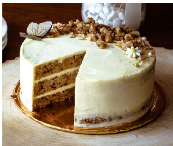
CE04 CARROT WALNUT Fresh Carrot & Walnut Sponge Cake, Walnut Topping, Cream Cheese Frosting