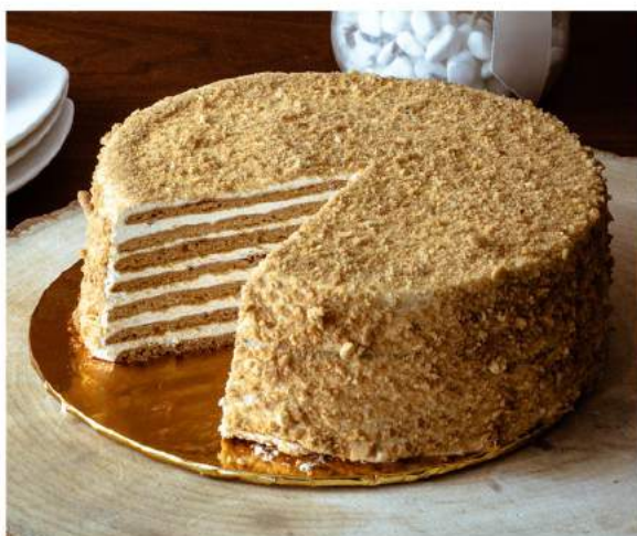
CE03 MEDOVIK RUSSIAN HONEY Fresh Honey, Whipped Cream, Honey Sponge Cake, Honey Dusted Topping