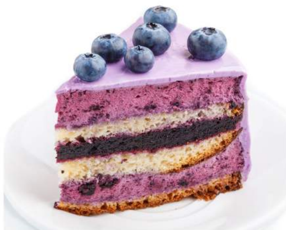
CE42 BLUEBERRY MOUSSE Blueberry Mousse, Blueberry Coulis, Vanilla Sponge Cake