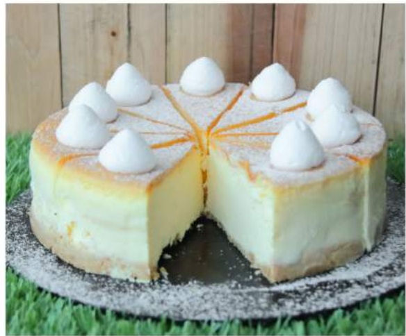
CE31 CLASSIC NEW YORK New York Style Baked Cheese, Biscuit Crumb Base, Whipped Cream