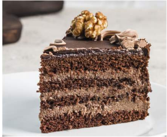
CE20 CHOCOLATE WALNUT Chocolate Couverture, Chocolate Sponge, Chocolate Whipped Cream, Walnut