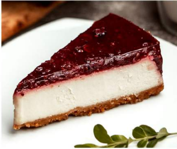
CE34 RASPBERRY LEMON CHEESE Raspberry Lemon Compote, Creamy Cheese Cake, Cookies Crumb Base