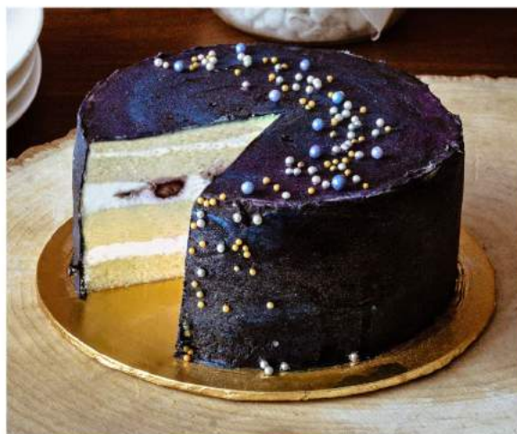
CE02 GALAXY CHOCOLATE BERRIES Chantilly Cream, Berries, Whipped Cream, Vanilla Sponge Cake