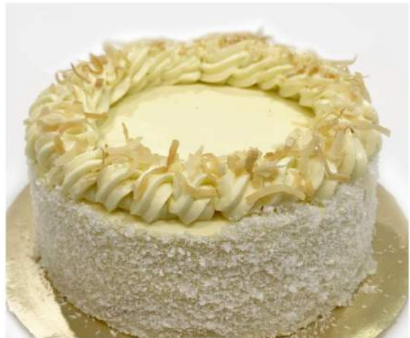
CE18 COCONUT LIME Fresh Lime Coulis, Hawaiian Coconut Cream, Vanilla Sponge