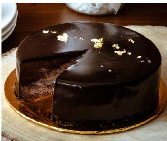
CE40 BELGIUM CHOCOLATE MOUSSE Dark Chocolate Sponge Cake, Dark Chocolate Mousse, Dark Chocolate Glaze