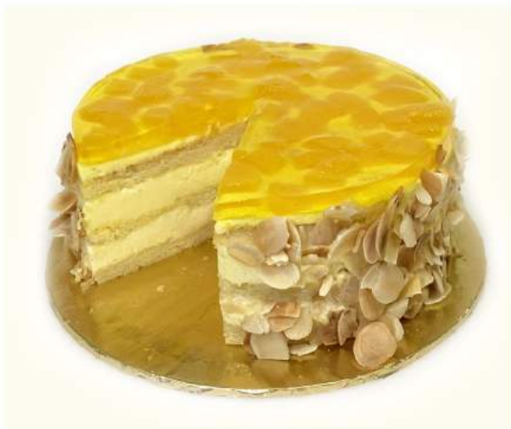
CE55 MANGO & PEACH MOUSSE MIRROR Fresh Mango, Fresh Peach, Infused Mousse, Vanilla Sponge Cake, Fresh Mango & Peach Chunk Topping