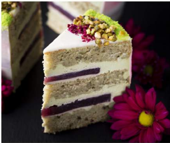
CE15 EARL GREY ROSE COULIS Earl Grey Sponge Cake, Earl Grey Infused Whipped Cream, Rose & Raspberry Coulis, Dried Rose & Pistachio Topping