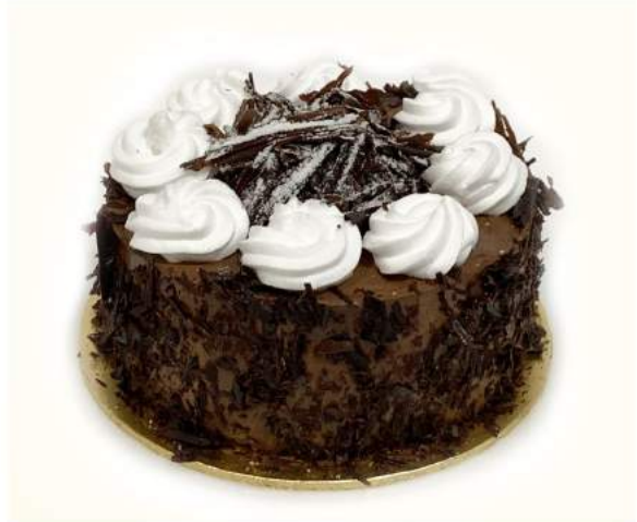
CE52 BLACK FOREST Dark Chocolate Sponge Cake, Whipped Cream, Dark Sweet Cherry, Dark Chocolate Shavings