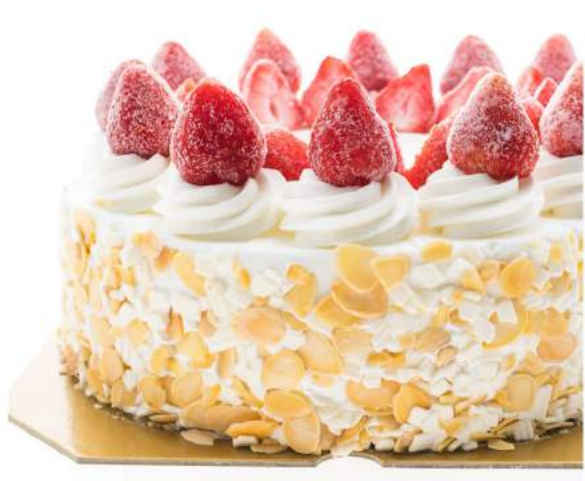
CE24 STRAWBERRY SHORTCAKE Fresh Strawberries, Vanilla Sponge Cake, Whipped Cream, Toasted Almond Flakes