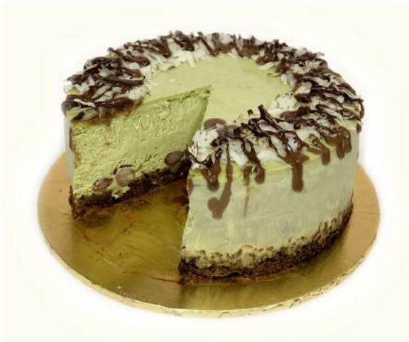
CE32 MATCHA CHEESE Matcha Baked Cheese, Kidney Bean Chunks, Cookies Crumb Base, Coconut Flakes Topping