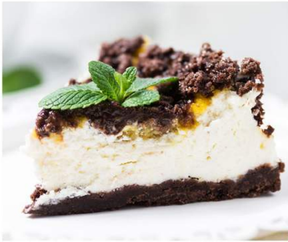
CE36 OREO PASSION FRUIT CHEESE Creamy Baked Cheese Cake, Fresh Passion Fruit Topping, Oreo Crumb Topping, Oreo Crumb Base