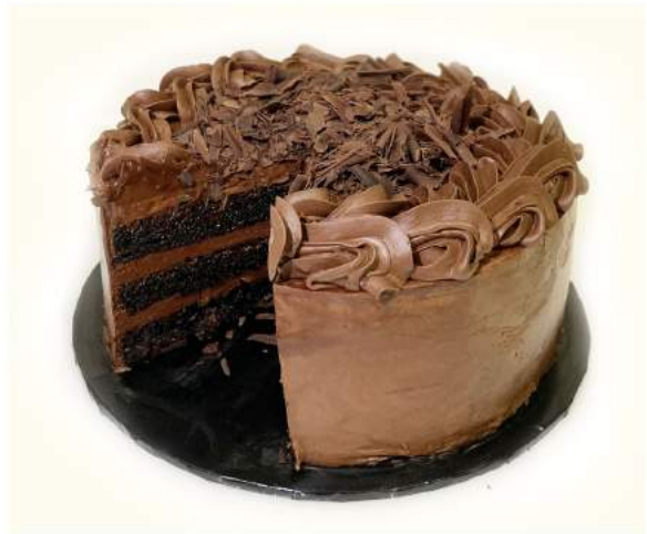
CE50 CHOCOLATE TRUFFLE Dark Chocolate Sponge Cake, Dark Chocolate Truffle Cream, Dark Chocolate Truffle Frosting