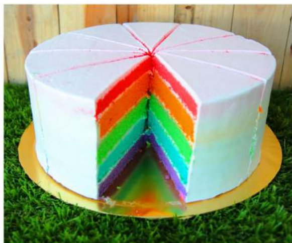
CE07 RAINBOW ROULETTE Rainbow Sponge Cakes, Non-dairy Frosting