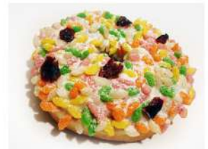
D21 HONEY RAINBOW RING