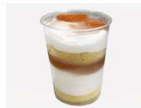
P08 HONEY PEACH SHORTCAKE