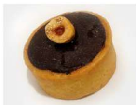
T3 TARTE AU CHOCOLATE NOISETTES