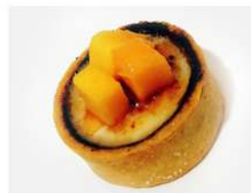
T12 BUTTERMILK MANGO TART BRULEE