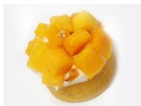
T5 TARTE AU CITRON MANGO