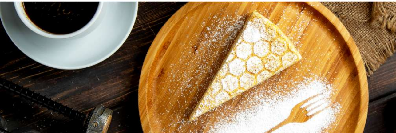
B19 HONEY CAKE