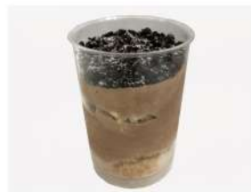
P07 PEANUT BUTTER MOUSSE