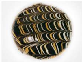
D6 CHOCOLATE PEANUT BERLINER