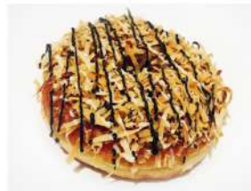
D20 KAYA COCONUT RING