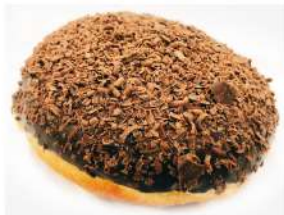
D1 BLACK FOREST BERLINER