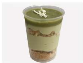
P01 MATCHA CHEESE CAKE