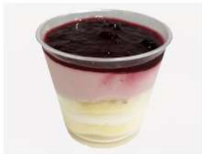
P17 RASPBERRY LEMON