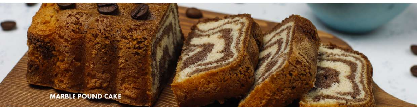
MARBLE POUND CAKE