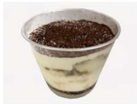
P18 TAKE ME AWAY