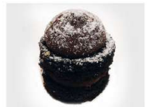
C4 CHOCOLATE MOIST FUDGE