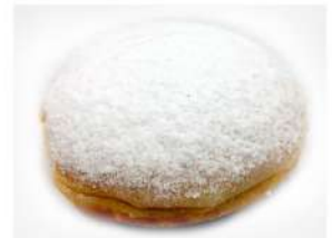
D11 SNOWY ICE BERLINER