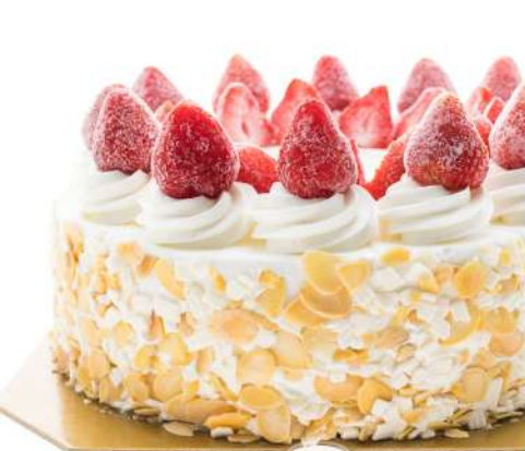
B22 STRAWBERRY SHORTCAKE