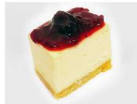
C7 RASPBERRY LEMON CHEESE