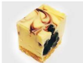
C6 BLUEBERRY CHEESE