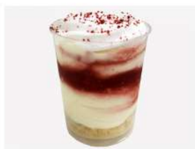
P02 STRAWBERRY CHEESE CAKE