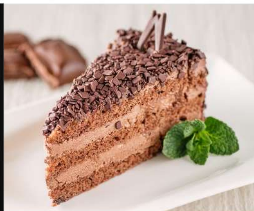
B21 CHOCOLATE COFFEE