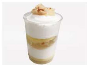
P09 LYCHEE JELLY SHORTCAKE