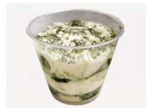
P16 MATCHA MISU