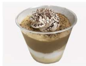
P15 COFFEE VANILLA