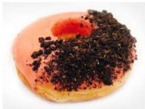
D10 PINK OREO RING