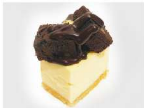
C5 BROWNIE EXPLOSION CHEESE