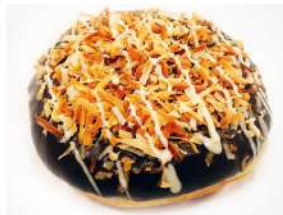
D2 HAWAII COCONUT BERLINER