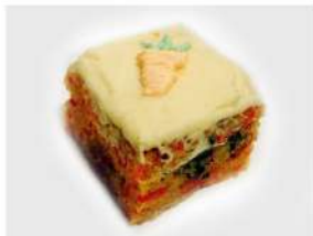
C9 CARROT WALNUT CHEESE