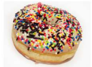
D18 CHOCOLATE RICE SURPRISE RING