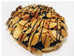
D24 ALMOND FLAKE RING