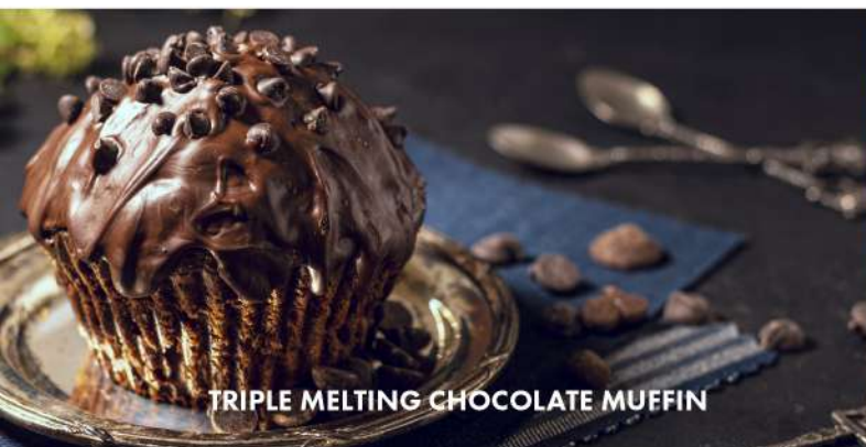
TRIPLE MELTING CHOCOLATE MUFFIN