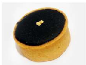
T1 TARTE AU CHOCOLATE