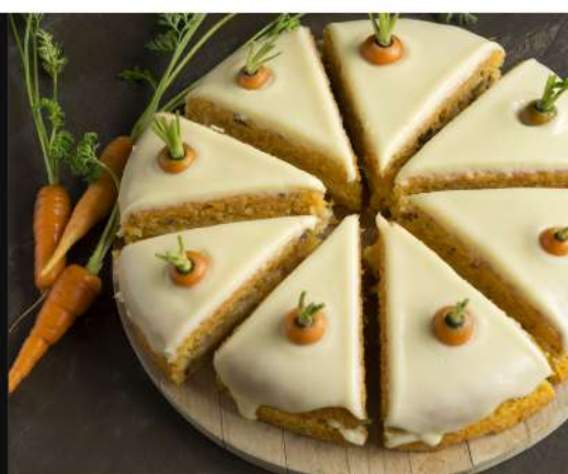
B23 MEDIEVAL CARROT