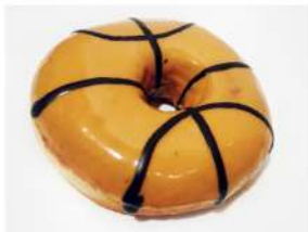
D23 PEANUT BASKETBALL RING