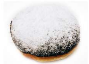
D4 CHOCOLATE BRULEE BERLINER