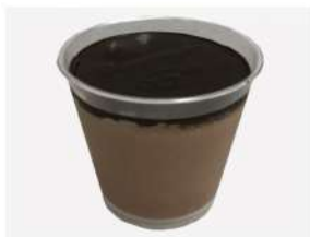
P13 CHOCOLATE BROWNIE