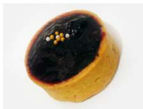
T10 MIXED BERRY PANNA COTTA TART