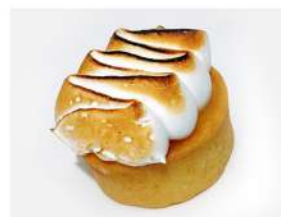
T4 TARTE AU CITRON