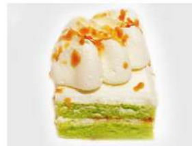
C11 PANDAN ONDEH ONDEH