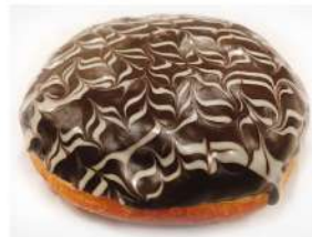
D3 MARBLE STONE BERLINER