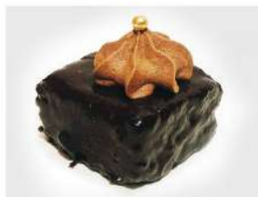
C2 BROWNIE PETIT FOUR