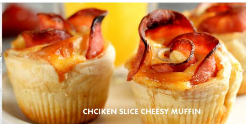
CHICKEN SLICE CHEESY MUFFIN