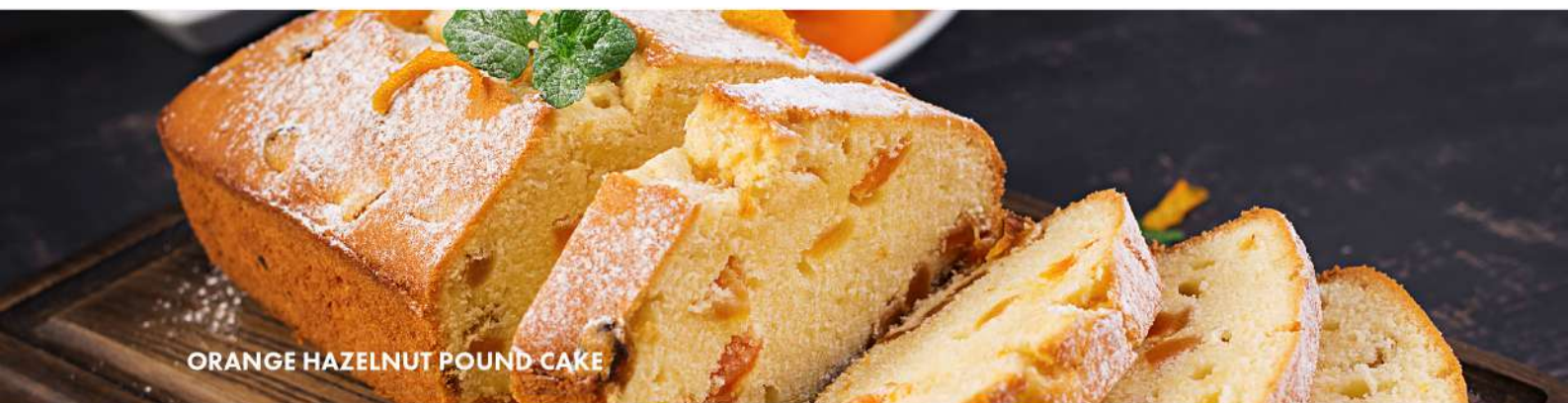
ORANGE HAZELNUT POUND CAKE