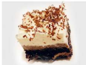
C10 BLACK FOREST