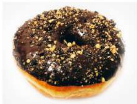
D5 CHOCOLATE CRUMB RING