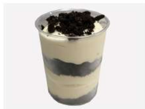
P05 OREO CHEESE CAKE