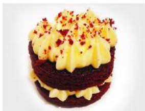
C1 MINI RED VELVET