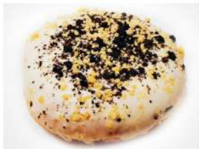
D12 WHITE CHOCOLATE COOKIES BERLINER