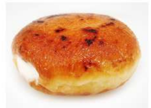
D16 CREME BRULEE BERLINER