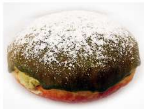
D14 MATCHA BERLINER