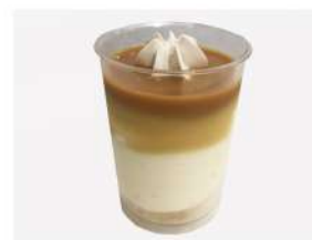
P04 TOFFEE CHEESE CAKE