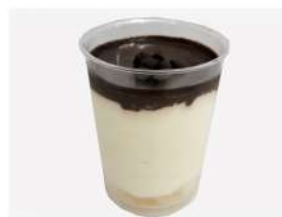
P03 CHOCOLATE CHEESE CAKE