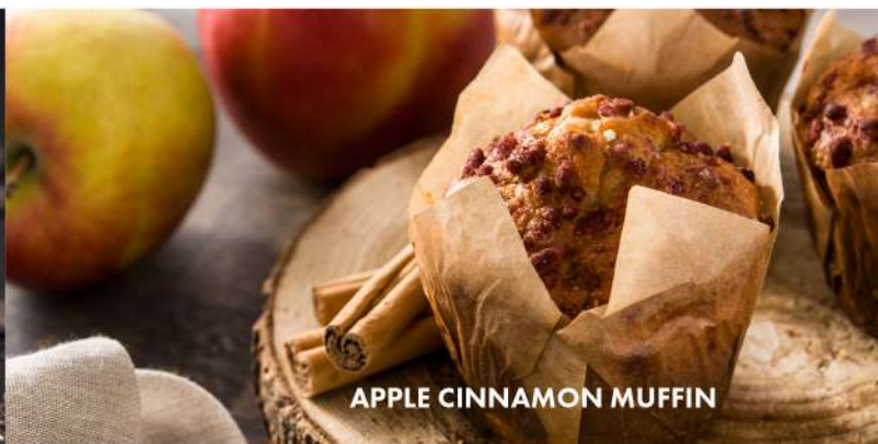
APPLE CINNAMON MUFFIN