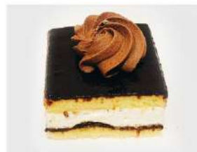
C3 BOSTON CREAM PIE