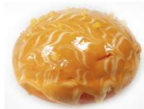
D9 PEANUT BERLINER