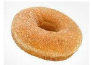
D13 SUGAR BASIC RING