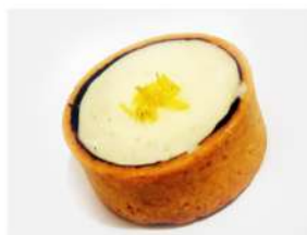
T7 LEMON CHEESE CAKE TART