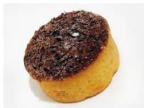
T9 MOCHA CRUNCHY TART