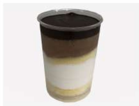
P06 CHOCOLATE HAZELNUT VANILLA