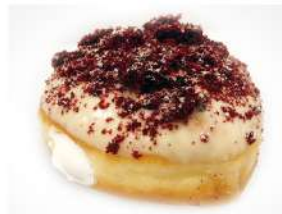
D15 VELVET BERLINER