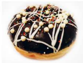
D8 CRISPY BALL BERLINER