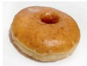
D25 GLAZY BASIC RING