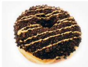
D7 OREO CASTLE RING