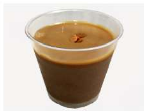
P14 CHOCOLATE CARAMEL BROWNIE