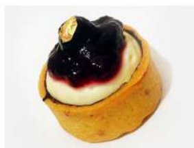
T6 BLUEBERRY CHEESE TART