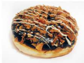
D19 MOCHA CRUNCH RING