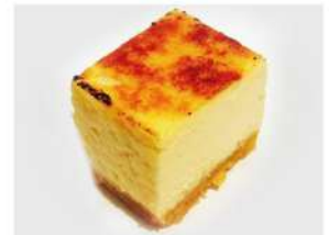
C8 CREME BRULEE CHEESE