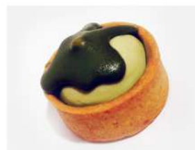
T8 GREEN TEA CHEESE TART