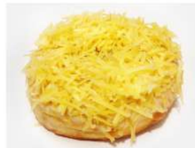
D17 CHOCOLATE CHEESE RING