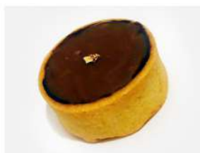
T2 TARTE AU CHOCOLATE CARAMEL