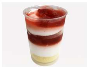
P10 STRAWBERRY SHORTCAKE