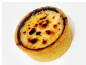
T11 CREME BRULEE TART