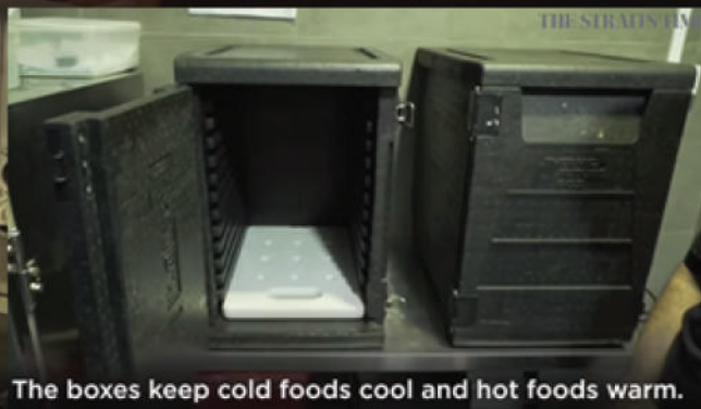
The boxes keep cold foods cool and hot foods warm.