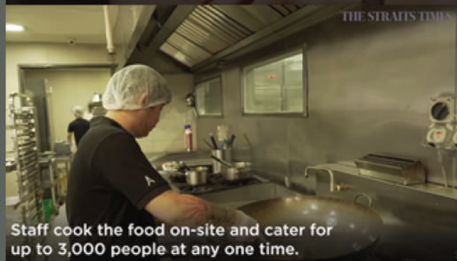
Staff cook the food on-site and cater for up to 3,000 people at any one time.

Cleanliness is, of course, the most important thing,